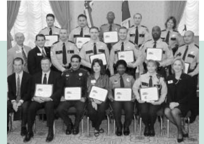
Over 15 public servants were recognized at the Chamber's September Public Servant's Appreciation Luncheon.