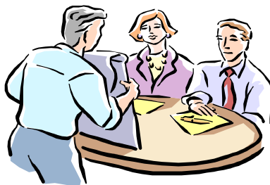
2006 Board Planning Retreat Friday, December 9th North Harris Montgomery Community College District