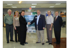
Previous Beautification Award Winner Mac Haik Dodge Chrysler Jeep

Nominated by: _____ Phone: _____ Email: _____