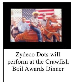
Zydeco Dots will perform at the Crawfish Boil Awards Dinner

If that isn't enough, there will also be a silent auction available for everyone to bid on great collectable and hard-to-find items.