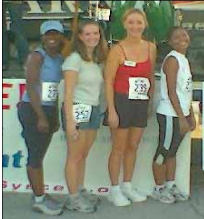
North Houston-Greenspoint runners at the Houston Airport System's Raceway for Life