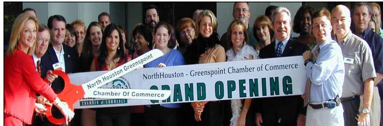
Members joined the staff in celebrating the Grand Opening of the new Chamber office!